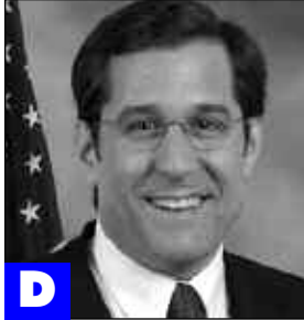
Steven R. Rothman

2 children. Serving fifth term in Congress, member of the House Appropriations Committee, fmr. member of the House Judiciary Committee. He has headed up many environmental causes, has been a strong voice for working families and individuals, and has sought ways to keep our schools and communities safe and drug-free. B.A. in Philosophy from Syracuse Univ., law degree from Washington Univ. School of Law. Practiced as a private attorney, winning awards for providing free legal service to the poor, disabled and elderly.