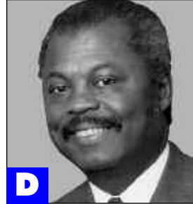
Donald M. Payne

Widower, 3 children. Seton Hall Univ., pursued graduate studies at Springfield College, Mass. Served on Newark Municipal Council, Essex Board of Chosen Freeholders, Prudential Insurance Co. Executive, V.P. of Urban Data Systems Inc., fmr. educator in Newark Public Schools, fmr. Nat'l. President of YMCA, fmr. chair of World Refugee & Rehabilitation Committee, Board of Directors for Nat'l. Endowment for Democracy, Boys & Girls Club of Newark, Newark Day Center, Fighting Back Initiative, & Newark YMCA. Member of House Committee on Education & the Workforce - ranking member. on subcommittee on Early Childhood Committee and its Subcommittee on Africa.