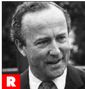
Rodney P. Frelinghuysen

Campaign office (973) 984-9539 www.tomwyka.com