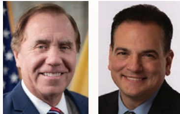
Joint Statement, Speaker of the Assembly, Assemblyman Craig Coughlin (D-Woodbridge) and Senate President, Senator Nick Scutari (D-Clark) August 3, 2023

We believe that families should have a voice in what is taught to their children, and as long as we have a say over the matter, they will continue to. And as always, all children deserve subject matter that is age appropriate, posted clearly and transparently for families to review, and free from any politics.”